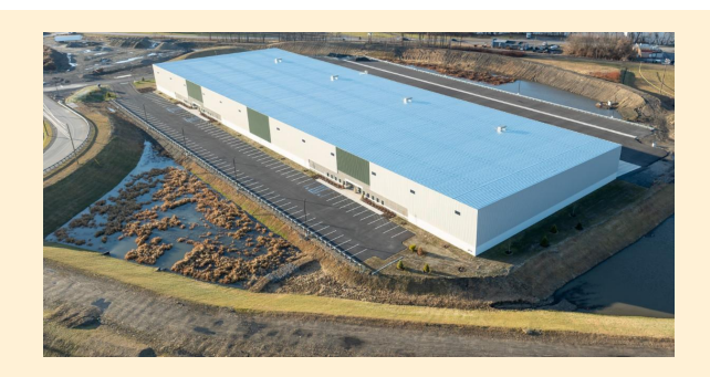
144-154 Commonwealth Drive, CenterPoint South, Jenkins Township - 136,500 SF

<u>Click here</u> to learn more about this property.