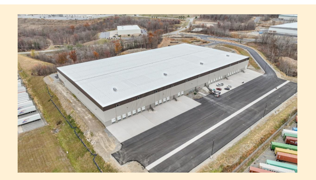
535-555 Research Drive, CenterPoint East, Pittston Township - 170,000 SF

<u>Click here</u> to learn more about this property.